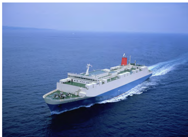
Musashi Maru, Ro-Ro Ship MOL Ferry Co., Ltd.

We hereby acknowledge the members of the ERM expert committee for their contribution and the cooperation for shootings extended by all the personnel on board Musashi Maru, a Ro-Ro ship of MOL Ferry Corporation Limited and Seiun Maru, a Training Ship of National Institute for Sea Training, Independent Administrative Institution, Japan in producing this DVD.