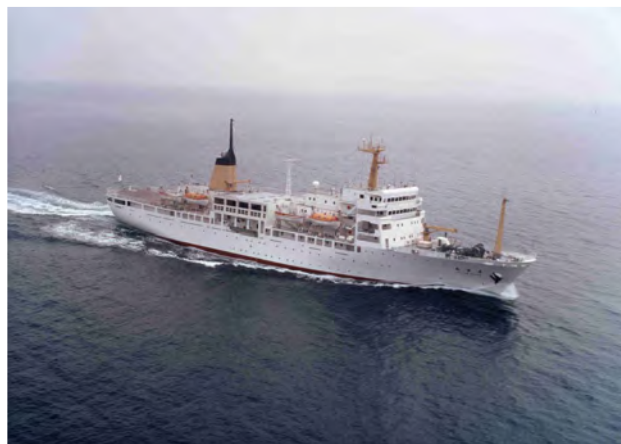
Seiun Maru, Training Ship National Institute for Sea Training

Planning & Produce: The Maritime Human Resource Institute, Japan